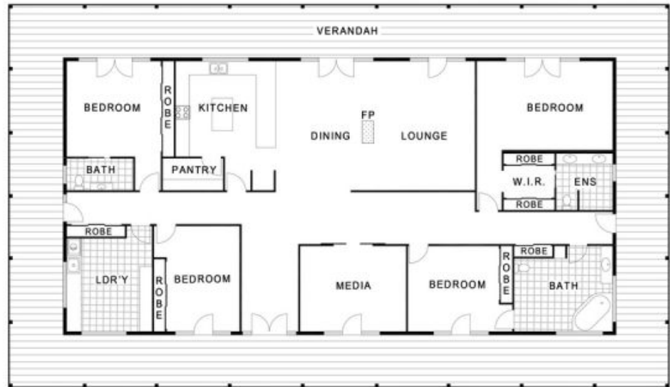
FLOOR PLAN (NOT TO SCALE)