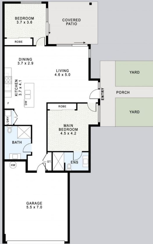
RESIDENCE : 138m 2