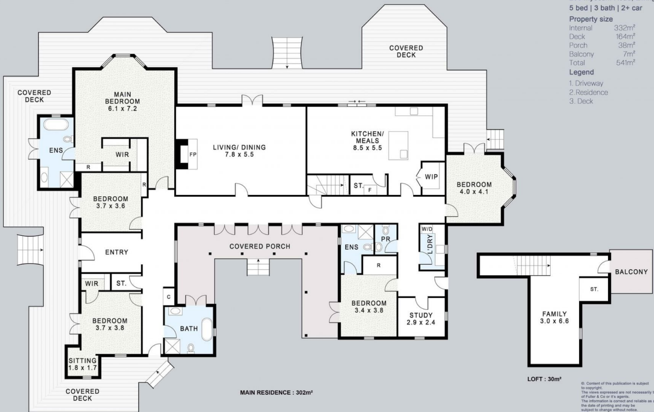
MAIN RESIDENCE : 302m 2