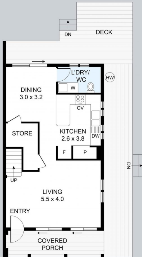
GROUND FLOOR : 55m 2