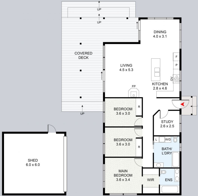
GARAGE : 36m 2 (NOT IN POSITION)