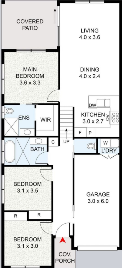
UNIT A : 112m 2 (INCLUDES GARAGE)